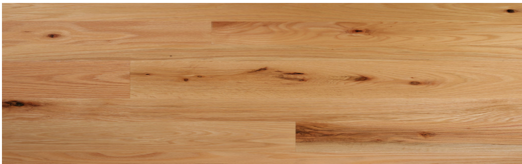
American Collection · Luxury Wide Plank Collection

Sands well with standard grit progression and accepts stains and finishes very nicely.